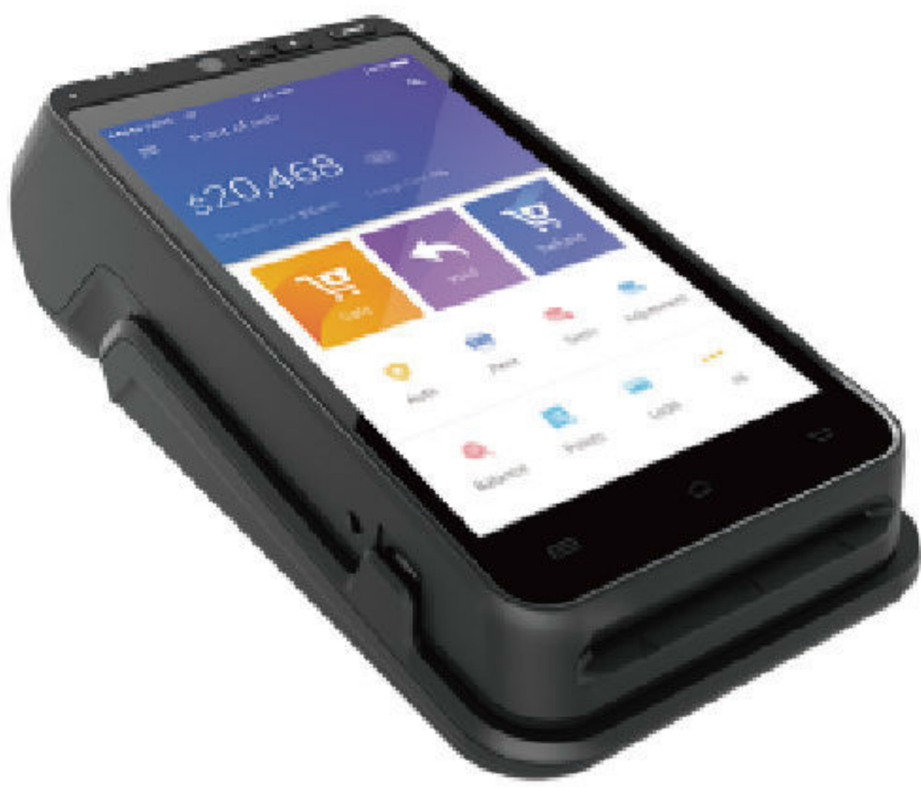
Docking station optional

Featuring a large 5.5-inch touch screen and powerful processing capabilities, the APOS A8 provides merchants best-in-class user experience to operate their integrated POS in an all-in-one handheld device.